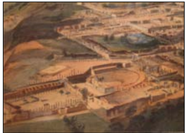
Figure 7: Topography of Theatre District within broader slope of site. Lithograph after drawing by A. Guesdon (1849).

Second, the size, integrity, and complexity of the “Theatre Passage Block” are all but invisible in plans (cf. Figure 1) and are easily overlooked in still photos where they appear to be a natural part of the theatre. One of the contributions that a 3D model can make therefore is to refocus the discussion of the Theatre district-- from its current focus on the monuments that make up the space to the way the monuments connect. The model helps the cyber visitor understand how structures like the Theatre Passage Block changed the way people experienced this difficult topography in a way that existing images, plans, and descriptions of the site do not. It broadens the definition of monumentality, posing the question of how the Holconii, and perhaps other building patrons, created a sense of cohesion and, with it, monumentality on this uneven terrain.