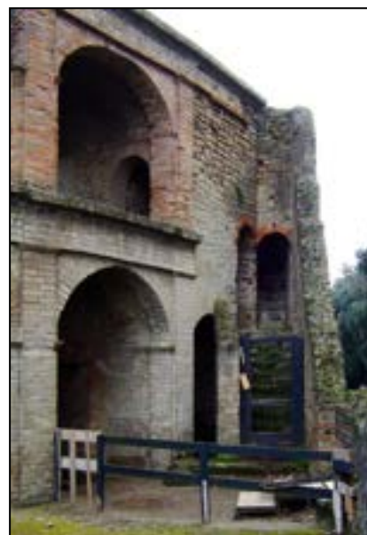
Figure 4: Theatre Passage Block. Stairs to upper seating (right), entrance to crypta (left), entrance to latrine (centre).

access routes between the theatre and the Triangular forum, in the form of a structure that we call the “Theatre Passage Block”. This structure separated the two areas visually but connected them at multiple levels. It included the eastern third of the crypta / ambulatory, with access doors to the cavea (Figure 3) and two staircases leading to the upper levels of seating (Figure 4). A small latrine was tucked into the space beneath the ambulatory and the staircases.