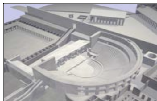
Figure 2: Virtual Theater District model in Unity format.

This project is loosely based on a now distant effort at model construction at Carnegie Mellon University's Studio for Creative Inquiry (Frischer 2000). Originally called “The Pompeii Project”, this was one of several early efforts intended to show that 3D models could be used to illustrate and interpret archaeological sites. The original model was built for small main-frame computers (SGI Onyx, SGI's Performer) and was based on photographs and print resources. It was intended primarily for museum audiences and, in a later effort, it was converted, with improvements, to VRML format and made web accessible (Jacobson 2005). The VRML model ran briefly at the Mobile Exploratorium and is available online (Pompeii 2010).