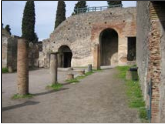
Figure 6: Colonnades between theatre (background left and rear) and small theatre (foreground right).

Since parts of both the inserted vault (Figure 5) and the new portico (Figure 6) are in red brick, this construction may be related to a rebuilding of the theatre scaena , or stage building, in the same material and excavation now suggests extensive Julio-Claudian (Neronian) rebuilding in the Triangular Forum (CARANDINI et al. 2001, CARAFA 2002) as well. There is evidence, therefore, for a much broader program of Julio-Claudian renovation across the theatre district than has been traditionally noted and one that will require a much broader effort than ours—with architect and formal survey—to describe.