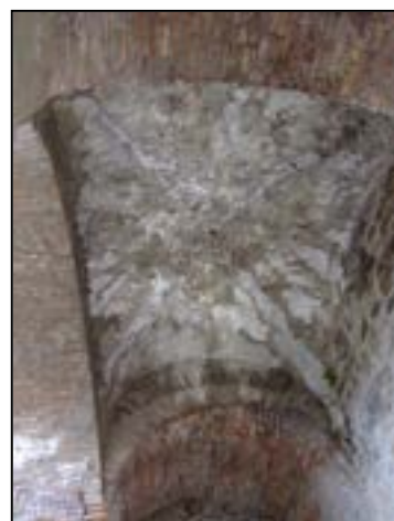
Figure 5: Corridor between theatre and Via Stabiana. Groin vault with brick arches.

The history of the theatre district before and after the Holconian project is unclear. Some connective tissue must have existed between the theatre and the “small theatre” before the Augustan period and post-Augustan construction was carried out there as well: a new arch and groin vault were inserted into the vaulted corridor leading from the Grand theatre to the street (Figure 5), probably to connect the corridor with a new set of colonnades built in front of it (Figure 6).