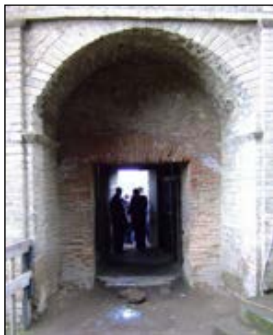
Figure 3: Entrance to the ambulatory/crypta from the Triangular Forum, with exit to the Theatre beyond.

based on new photographs and measurements taken on the site. This new model is web based and it will be the centrepiece of an innovative web site that allows the cyber visitor to compare individual elements from the model with photographs and historical images (JACOBSON 2010). Eventually, the user will be able to navigate efficiently between the virtual space, the data, the metadata, and the way these data have been interpreted. The website will be flexible enough to accommodate new information for later development of the site as it becomes available.